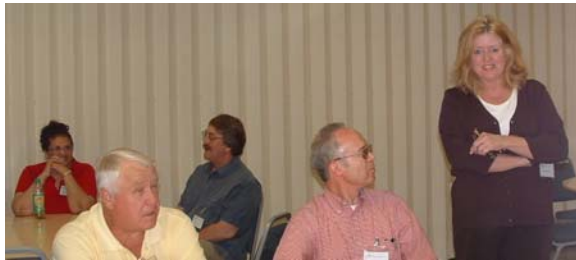
AACEI-CSRA Dinner Meeting Attendees (8/28/08)

Congratulations to the following on attaining new certifications!