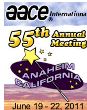
Next Year's Annual Meeting will be in Anaheim, California.